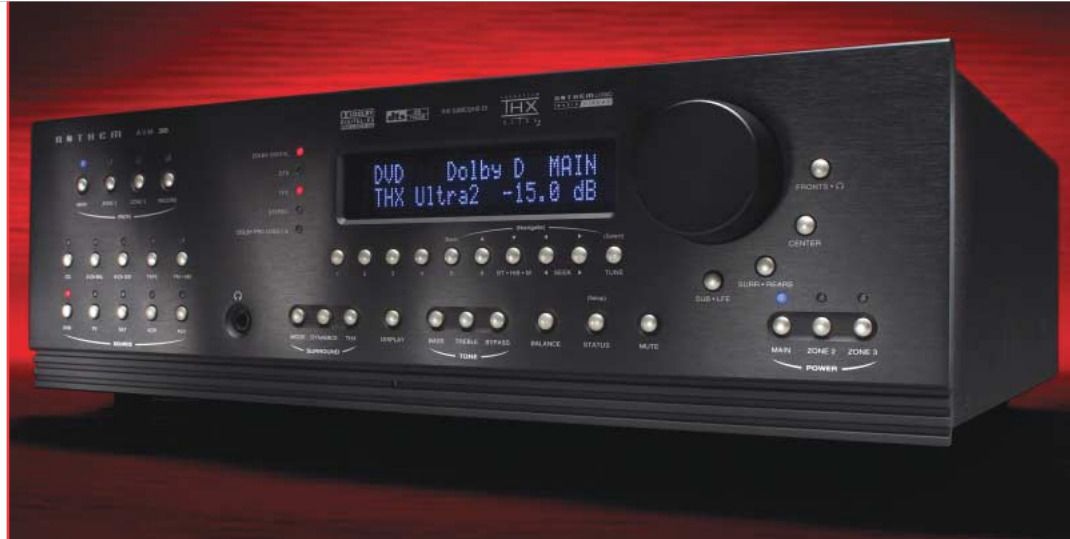
*The AVM 30 (shown) incorporates design improvements for better performance