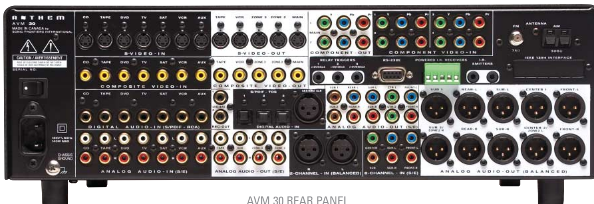
AVM 30 REAR PANEL

The energy in the DVD Titan A.E./DTS was very well rendered by the Anthem combo. The high frequencies in standard mode were very clear, without being overly aggressive. The “ping-pong” effect frequently present in multichannel sound was almost unnoticeable. The transitions between the various