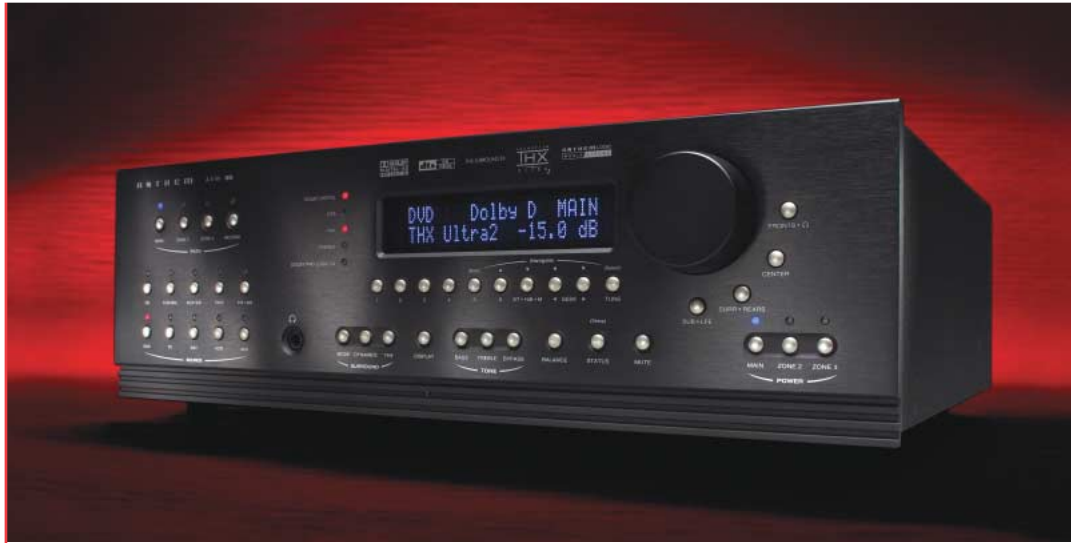
*The AVM 30 (shown) incorporates design improvements for even better performance