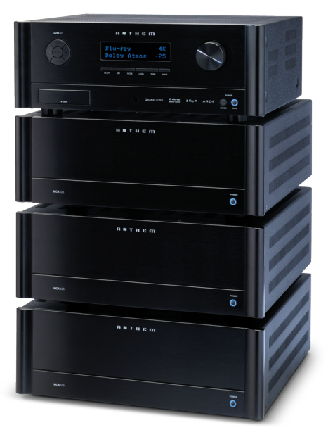
AVM 60 Preamplifier teamed with two MCA 325s and a MCA 525